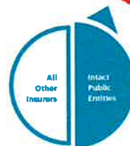
Municipal Market Share Leader in Ontario