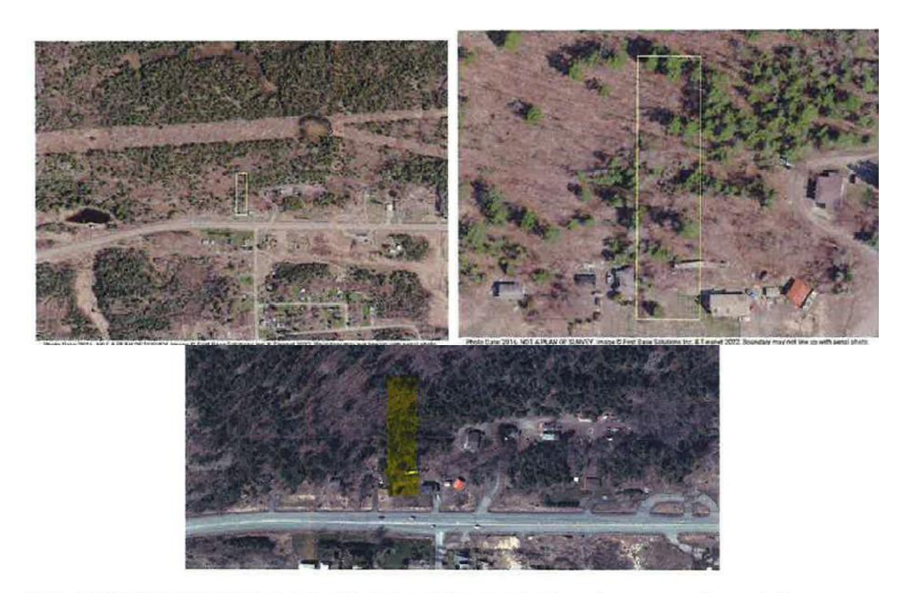
Maps and photos are provided as a courtesy only and the municipality makes no warranties as to the accuracy of this information. Boundaries on aerial photos may be skewed.