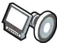
Aftermarket Vehicle Audio & Video Devices