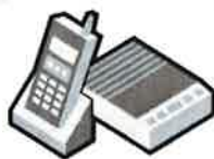
Telephone & Telephone Answering Machines