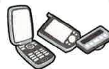
Cellular Devices & Pagers