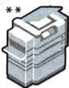
**Restrictions may apply for this item